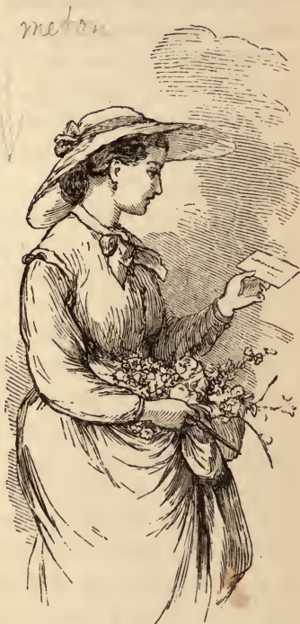
“From John, good fellow.”

S PRINGDALE was one of those beautiful rural towns whose flourishing aspect is a striking exponent of the peculiarities of New-England life. The ride through it presents a refreshing picture of wide, cool, grassy streets, overhung with green arches of elm, with rows of large, handsome houses on either side, each standing back from the street in its own retired square of gardens, green turf, shady trees, and flowering shrubs. It was, so to speak, a little city of country-seats. It spoke of wealth, thrift, leisure, cultivation, quiet, thoughtful habits, and moral tastes.